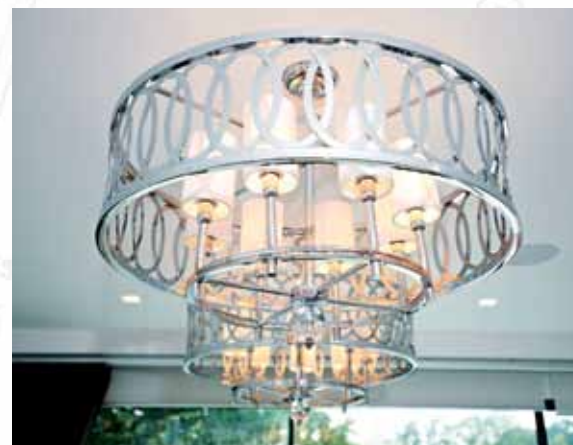
Lighting: The the property features several handmade chandeliers, all installed by Ship Shape's electrical services team.