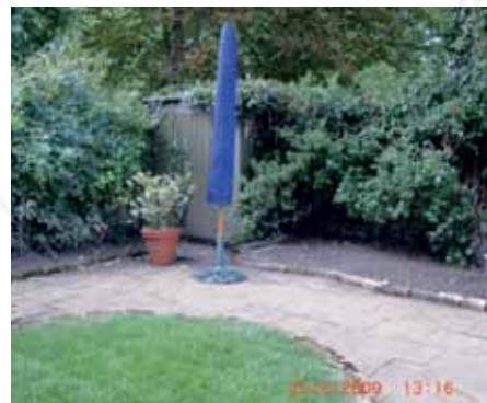
Before: Rear patio area.

High quality landscaping work completely transformed the properties outdoor space. Work undertaken by Ship Shape included; repointing the exterior of the building, rebuilding the boundary wall, marble tiling, erection of a stainless steel external metal staircase leading down to the basement, architectural metal works, built in BBQ and a bespoke marble water feature.