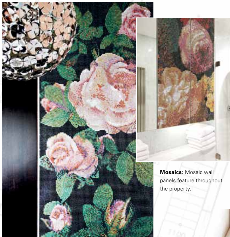
Mosaics: Mosaic wall panels feature throughout the property.