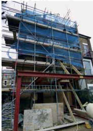
In progress: Rear extension.