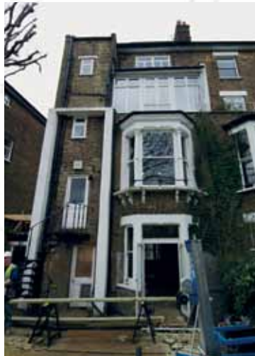
Before: Rear extension.

Cantifix glazed sliding doors were fitted, leading from lower ground floor kitchen out on to the rear patio area.