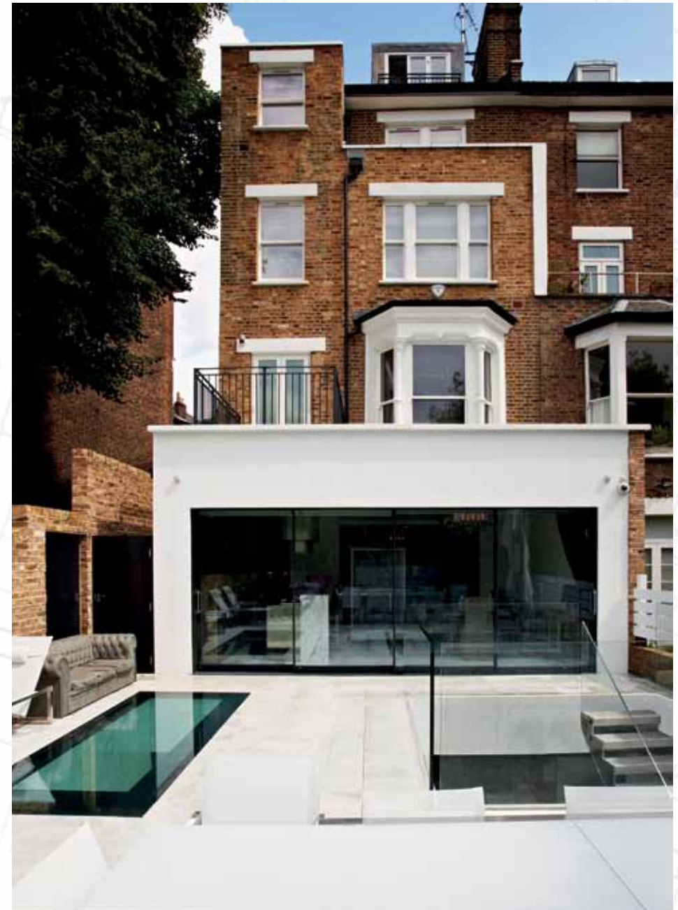
Completion: Rear extension.