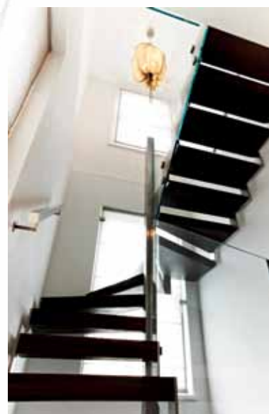
Staircases: The property now spans over six floors; connected via striking staircases such as the bespoke cantilevered staircase in the entrance hall and a stainless steel self supporting zig zag staircase to upper floors.